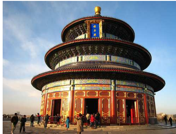
Temple of Heaven, Beijing, China

FOR ADDITIONAL INFORMATION, PLEASE CONTACT: