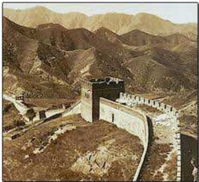
The Great Wall of China.